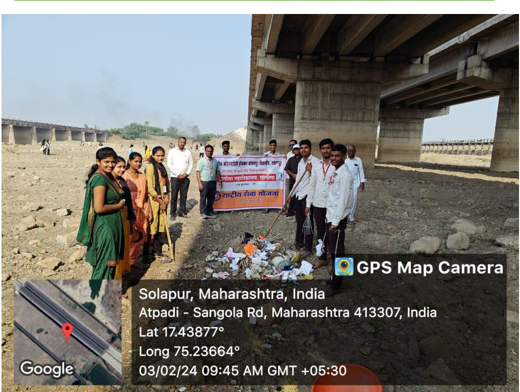
NSS Volunteer participants in Maan River cleanness Activity.